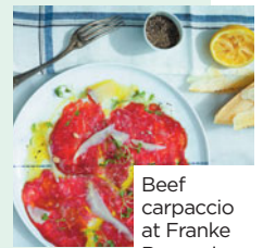
Beef carpaccio at Franke Brasserie

Totally organic, their grill offers the juiciest entrecote in town. Restaurant am Steinplatz (0049-30-554 4440, hotelsteinplatz.com ) situated at the Hotel am Steinplatz has elevated traditional heavy Berliner fare to an art form. The Königsberger klopse (boiled veal dumplings) are melt-in-your-mouth light. Meanwhile, Diener (0049-30-881 5329) holds on to its storied past with old-school food and atmosphere. Dark walls are hung with portraits of artists who've frequented the establishment. You must try the eggs in mustard sauce, a local favourite. At the other end of the spectrum is Balthazar (0049-30-8940 8477, balthazar-restaurant.de ), purveyors of “Metropolitan” cuisine that plays with a spectrum of flavours – Asian, Italian and German. The Asian lobster salad is a revelation. For a post-dinner drink, Universum Lounge