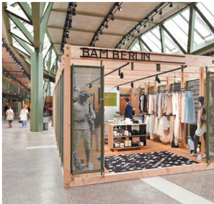
Clockwise from top left: Enjoy a concert at Berlin Philharmonic; a sculpture frames the Kaiser Wilhelm Memorial Church, the symbolic centre of City West; pick up local designer wares at Bikini Berlin mall

and Gardens (0049-30-32 0911, spsg.de ) was erected as the summer palace of Sophie Charlotte, the first queen of Prussia. Today, Rolls-Royces and Mercedes queue as newlyweds wait to be photographed in the famous Baroque gardens. Beat the crowds by attending the Berlin Residence Concert (0049-30-2581 0350, concerts-berlin.com ), featuring masterpieces from the Baroque and early Classical eras, in the Great Orangery on Wednesday, Friday and Saturday evenings.