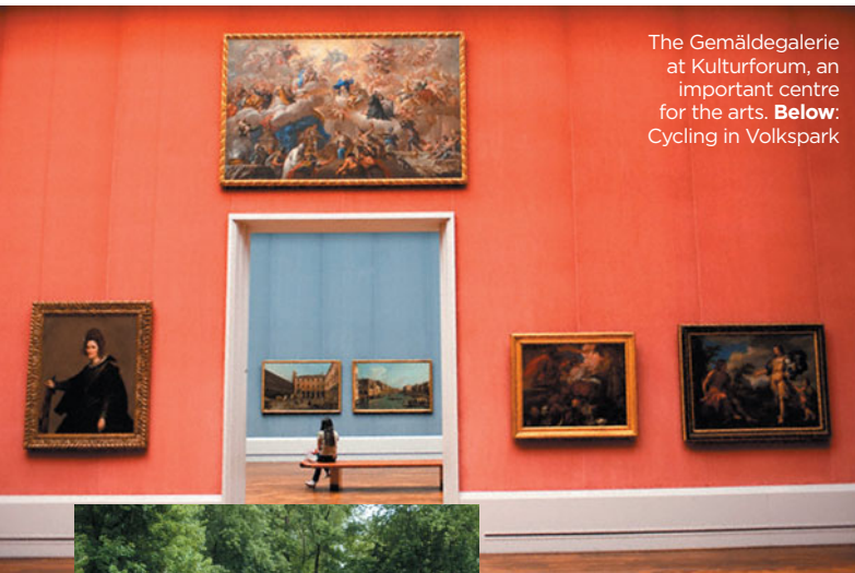
The Gemäldegalerie at Kulturforum, an important centre for the arts. Below: Cycling in Volkspark